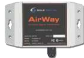
AirWay Wireless Signal Transceiver