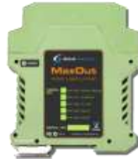
MaxOut Hoist Load Limiter