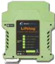
Liftlog™ Crane Data Logger

HoistNet is now enabled on the following Sole Digital products: