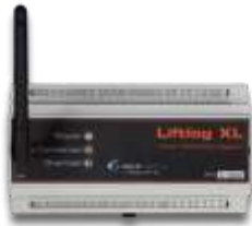
LiftlogXL Real-time Data Logger