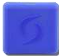
AccessPack RFID Access Control System