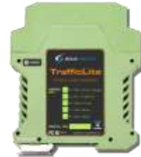
TrafficLite 4 Point Load Indicator