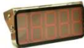
HiBeam Load Display