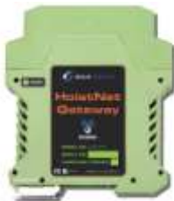
HoistNet Gateway HoistNet Transceiver