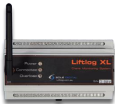
LiftlogXL Real-time Data Logger