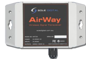
AirWay Wireless Signal Transceiver