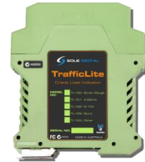
TrafficLite 4 Point Load Indicator