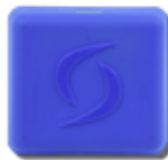
AccessPack RFID Access Control System