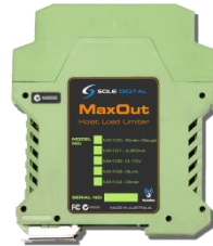
MaxOut Hoist Load Limiter