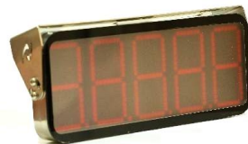
HiBeam Load Display