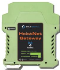
HoistNet Gateway HoistNet Transceiver