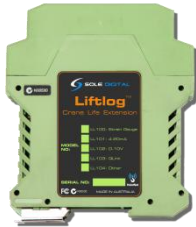
Liftlog™ Crane Data Logger

HoistNet is now enabled on the following Sole Digital products: